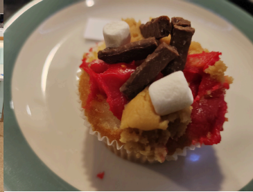
Bonfire cake making